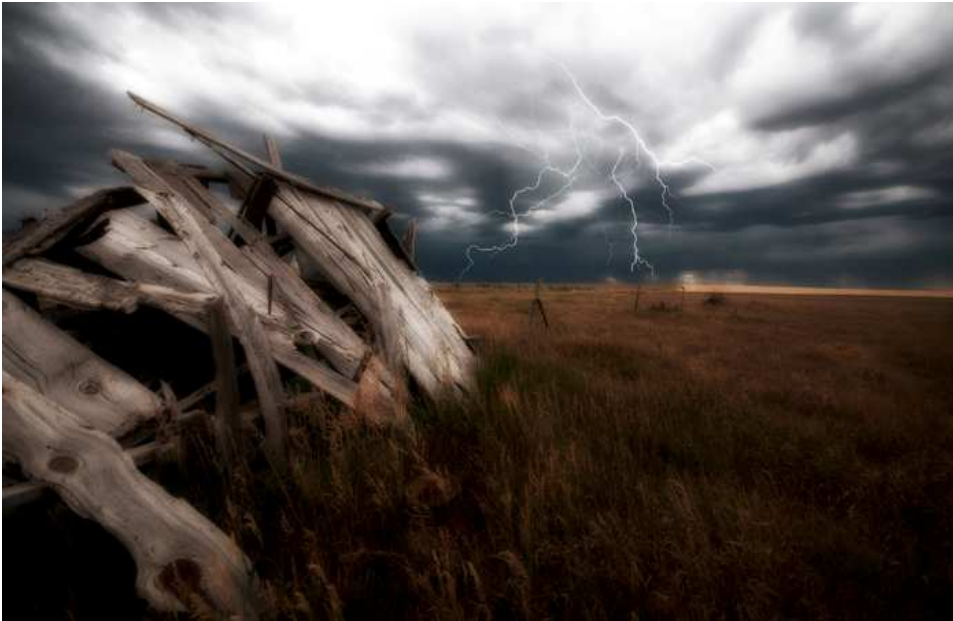
“Mood Lighting” by Debi Boucher

PHOTOGRAPHIC TRUTH: When your printer runs out of ink, it's cheaper to replace the printer than the cartridges.