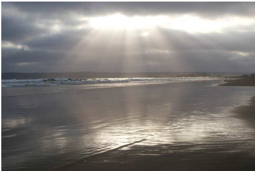
"Misty Beach" by Galen Short