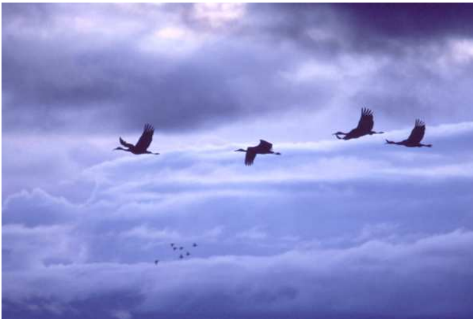
“Rainy Day on the Refuge” by Jerry Moldenhauer

Tuesday, September 18, 2012 – Workshop on How to resize images for competition and How to change color space to sRGB for competition