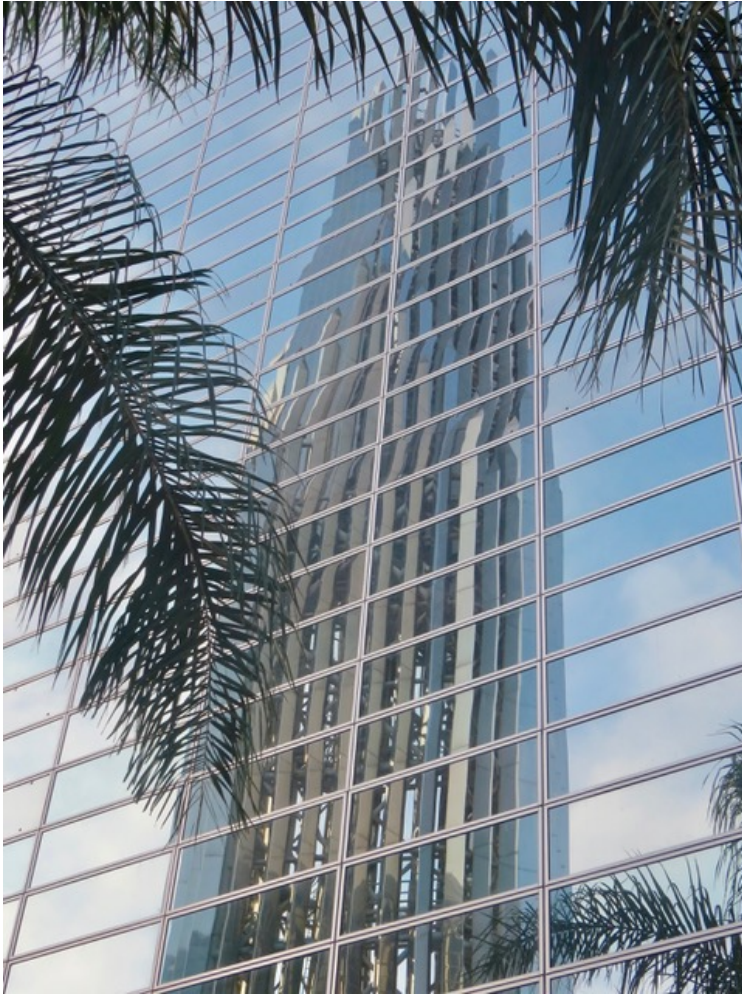
“Cathedral Reflection” by Rita Steinhauer

This shot was among twenty photos I took while visiting the Crystal Cathedral in Garden Grove, CA in July, 2017. It was the last day of my visit to a friend in Orange County, CA. We got up early to take photos of the beach, but it was a cool, cloudy day, so my friend suggested the Cathedral instead. While there we learned that the original building was sold to the Catholic Church recently (the original Reformed Church founded by Robert Schuller had filed for bankruptcy in 2013). The actual church was closed for renovation until 2019 when it will then be formally known as Christ Church of the Roman Catholic Diocese.